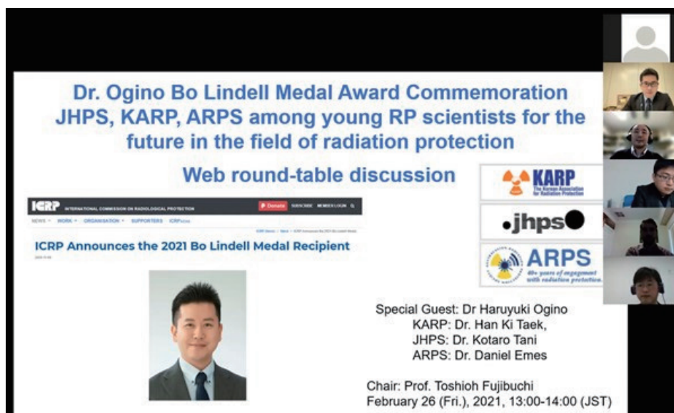
Fig. 1. Round-table discussion start screen.